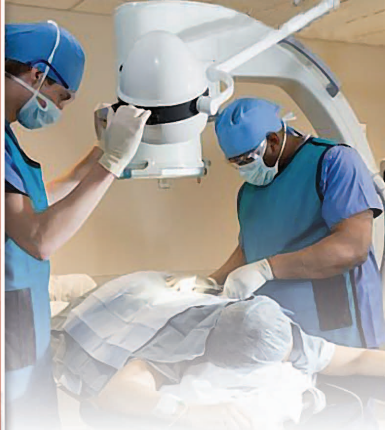
Carbon fiber diving board style imaging table "absolutely the best price and value in the table industry"

The Streamline series is the lowest priced table in the imaging table industry. This line along with the best selling Max series and EconoMax series tables, makes STI the company with the most table options to choose from in the medical table business.