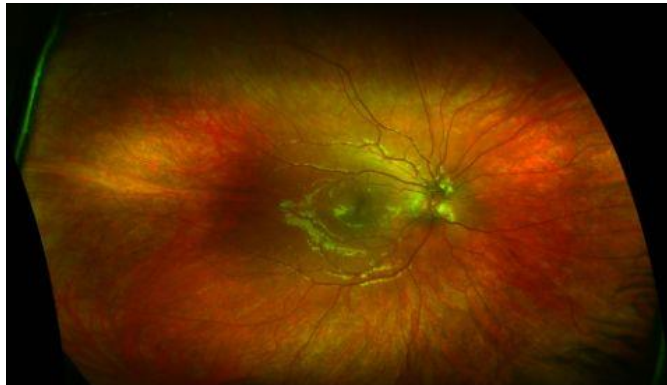
Normal Wide field retinal image on the Optomap retinal exam

Thank you for choosing our practice to protect the health of your eyes!